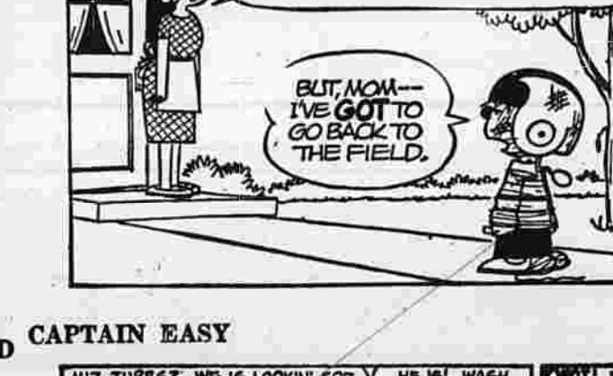
BY LESLIE LEWIS